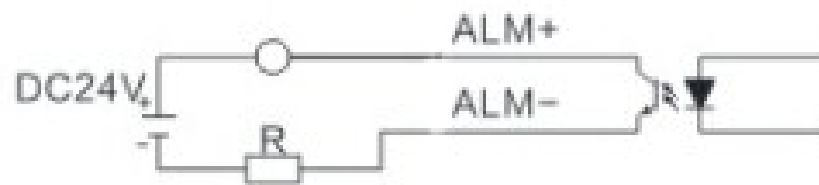
Alarm in place output wiring diagram

The driver uses a six-digit DIP switch to set the subdivision and motor rotation direction. The detailed description is as follows: