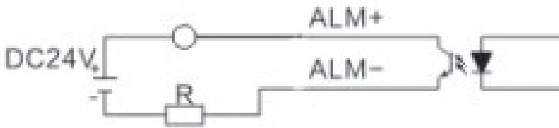
Alarm in place output wiring diagram

The driver uses a six-digit DIP switch to set the subdivision and motor rotation direction. The detailed description is as follows: